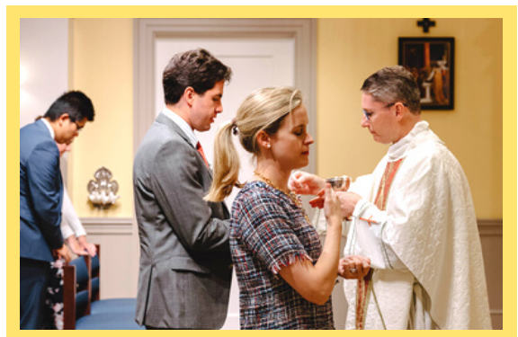
When you are in downtown DC, please join us for the CIC's daily weekday Mass at 12:00pm.

Daily Mass is offered at noon, Monday through Friday, except on federal holidays. Confession is also available before and after Mass.