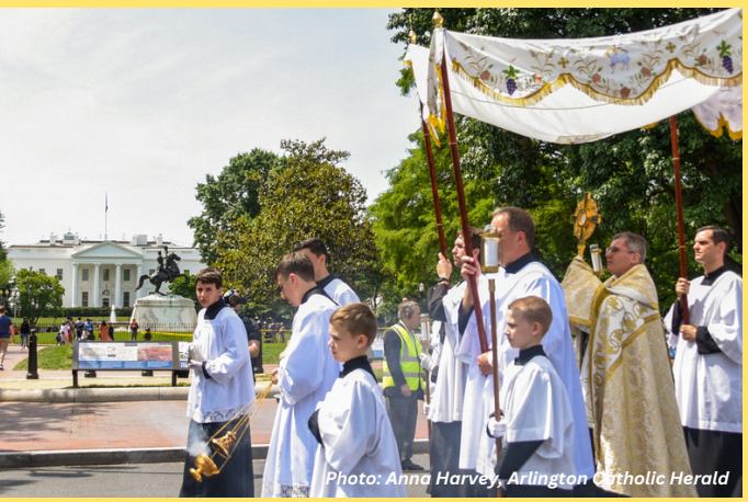
[Left] 700+ people gathered around the Blessed Sacrament at an altar station located by the US Dept. of Veterans Affairs building. [Right] The procession carried Christ's Real Presence past Lafayette Square and the White House.

The crowd included many families, religious sisters, children who had just made their first communion, and young professionals who frequent the CIC.