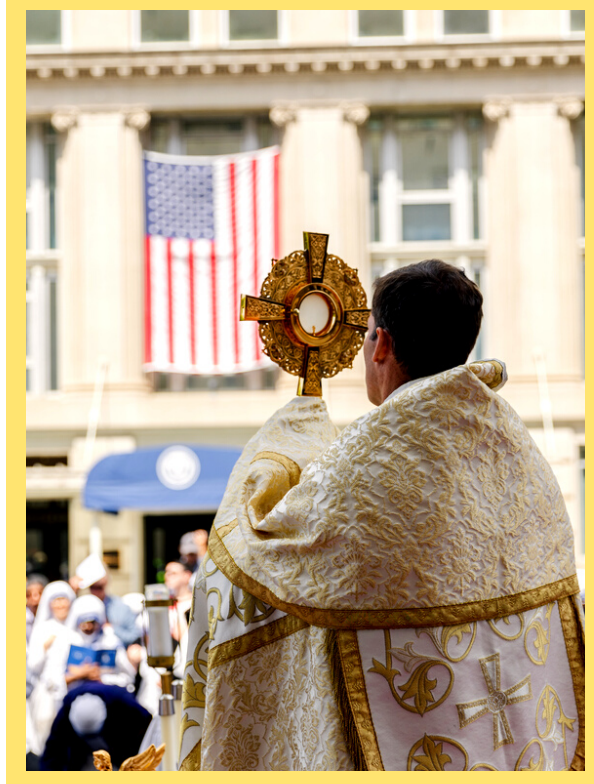
Blessing the crowd during benediction outside the Veterans Affairs Building.

first annual Eucharistic procession and the National Eucharistic Revival.