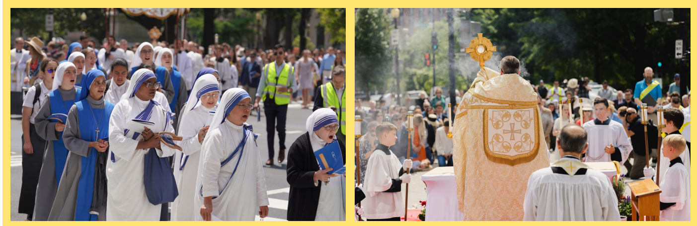
[Left] We're grateful to the many religious sisters who joined us in prayer. [Right] Blessing the crowd.

Once the procession left the CIC, a staff member encountered two astonished Australian tourists standing at the corner of 16th and K Streets. They said, "We cannot believe we just walked out of our hotel to see a Eucharistic procession going down the middle of the street in Washington, DC."